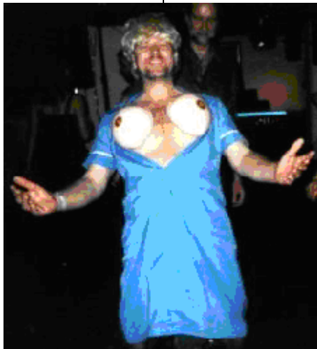
Oh no. WHO let that out?